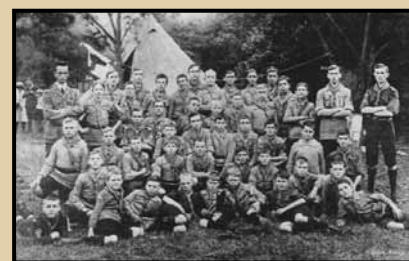
St Thomas scouts camping at Ocean Beach, Durban - 9 April 1915.